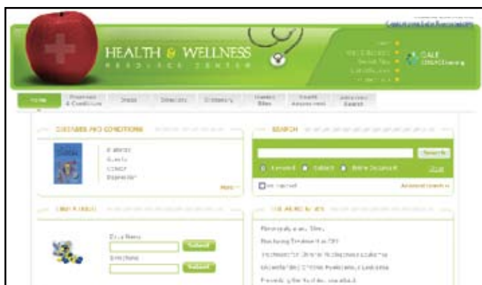
▲ Health & Wellness Resource Center features an updated, intuitive search interface facilitating quick access to information

Amid the chaos of the Internet, Gale has reserved places just for students and library users. A Resource Center is a safe haven, where an ever-increasing list of primary documents, periodicals and reference information is seamlessly integrated and research skills pay off. Far removed from the pitfalls of the open Web, Resource Centers allow users to determine search criteria, retrieve relevant results and find reliable information in a variety of formats.