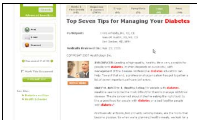
▲ Content includes hundreds of streaming videos from experts in the medical field